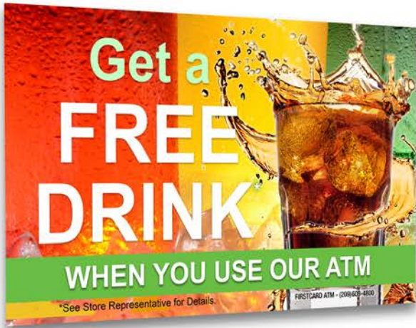
ATM On-Screen Advertising